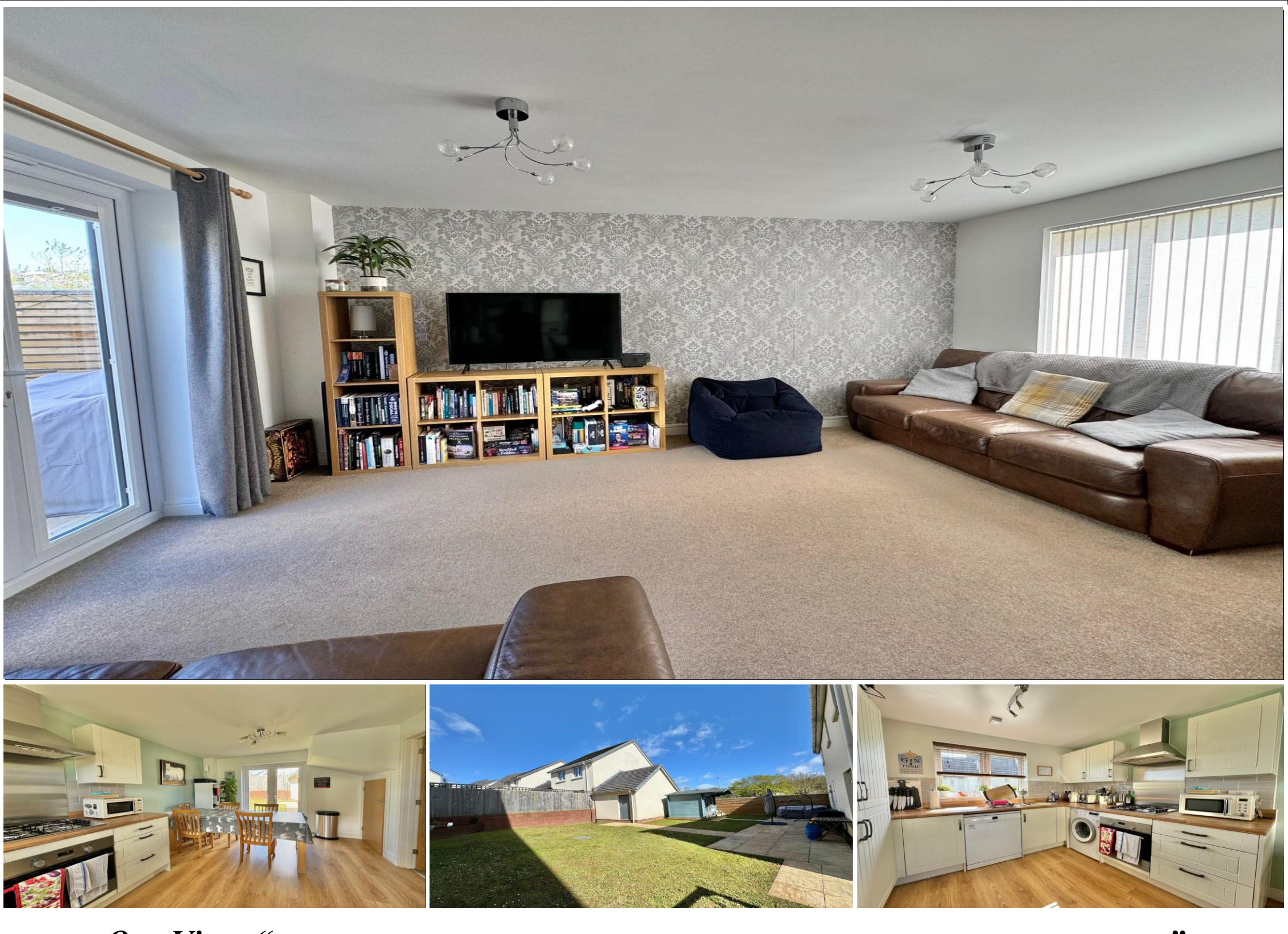
Our View "A superb contemporary detached family home in a convenient location close to schools and amenities"

A superb, well presented three bedroom detached property with private spacious gardens, off road parking and garage situated in Kingsteignton offering good access to local amenities